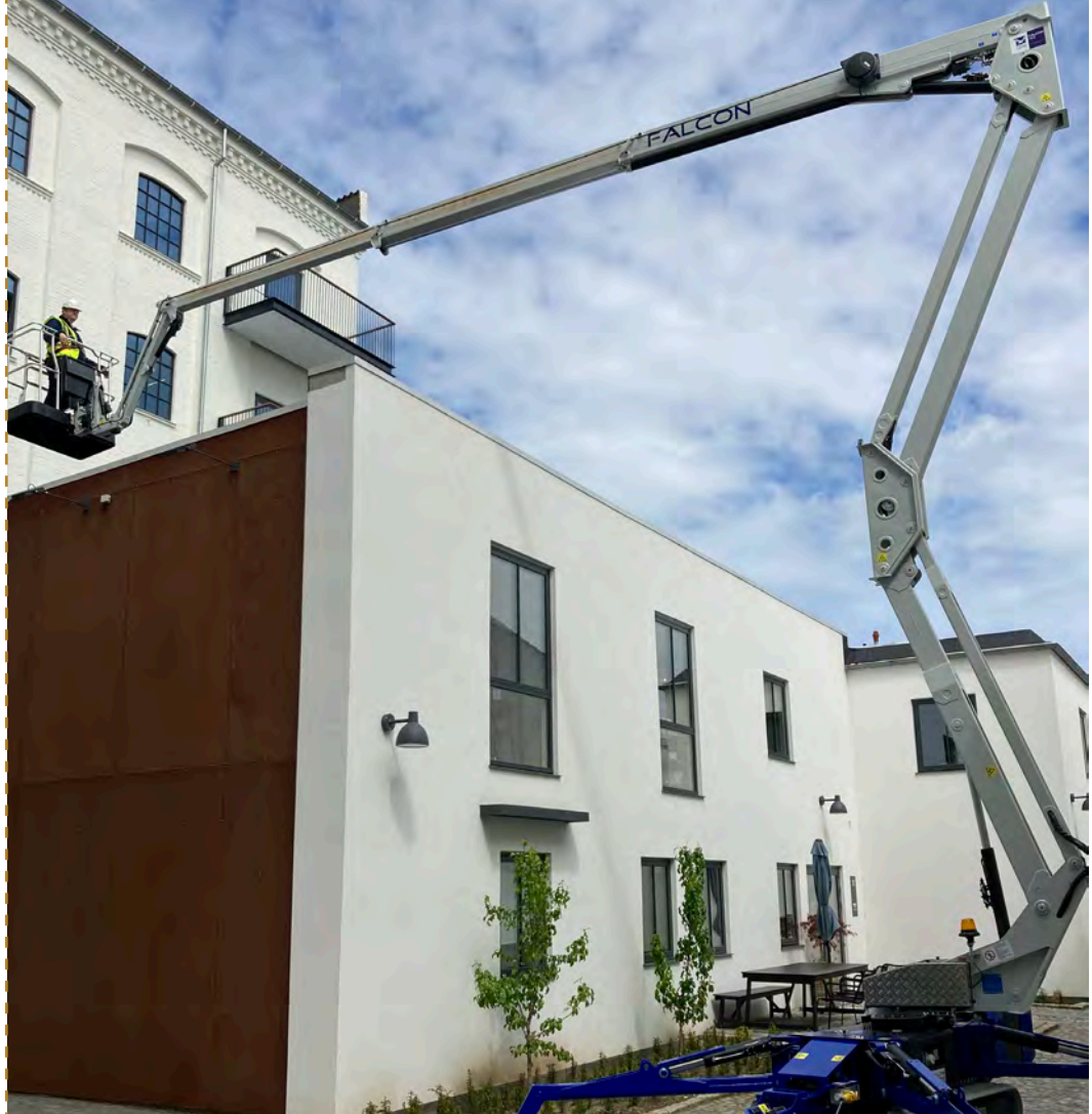
Model: Falcon 230Z Falcon 76Z